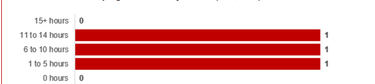
Hours of unfunded 3YO programs currently offered (DET, 2019):